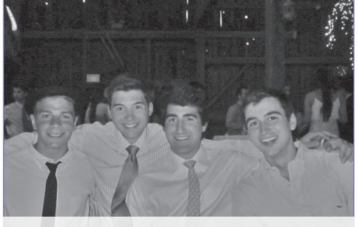
The men of Sigma Pi are always ready to demonstrate their fraternal bonds with a group photo.

a clothing drive sponsored by Cornell Big Red Shipping, an organization run by one of the brothers in the house. We placed boxes in several sorority and fraternity houses around campus in the hope that we can collect a fair amount of clothing to donate to New York Cares Coat Drive and other local organizations and homeless shelters.